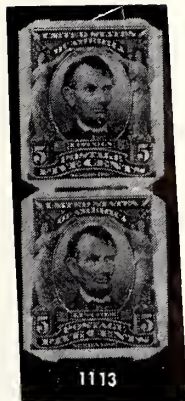
1113 ★ 5c Blue Lincoln, U.S. Auto Vending Ty. 1 Private Perf. (315). Vertical Pair, V.F. (Photo) 120.00